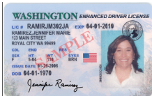
Enhanced Driver's License - Facial Recognition - RFID chip – used as a DL/ID-passport for border-states