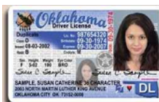
Driver's License with Facial Recognition Biometrics