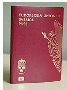
EU e-Passport with biometrics, RFID chip and ICAO biometric e-Passport Logo