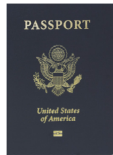
US e-Passport with biometrics, RFID chip and ICAO biometric e-Passport Logo